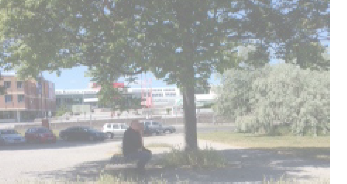
Observations of pedestrians utilizing green spaces